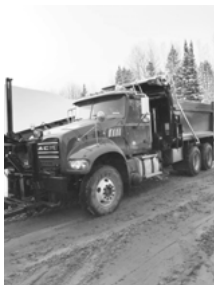
2019 Mack Truck

We would like to thank all the residents of The Town of Greensboro who continue to support our highway budget each year. This year, the equipment upgrade went to the new Mack truck, which we are thankful to have ordered.