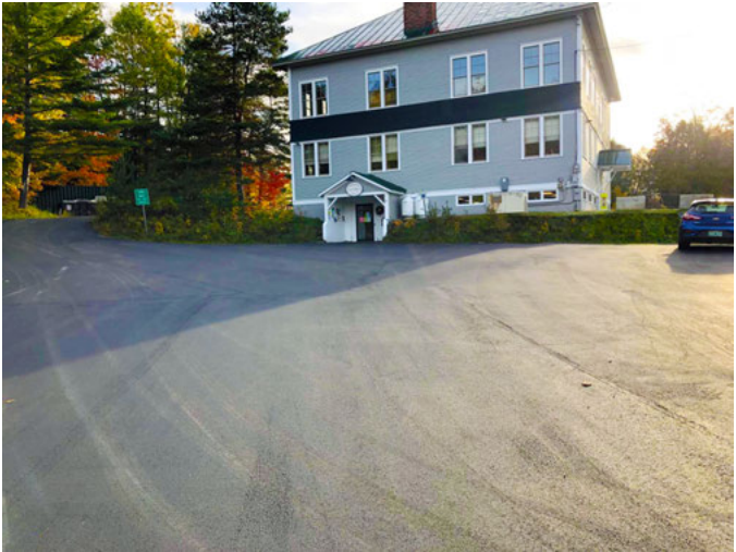
Greensboro Town Hall Entrance

Tuesday, March 3, 2020 at 10 AM Highland Center For The Arts Greensboro, VT