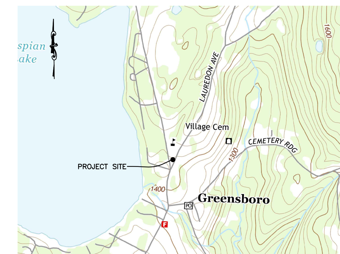
SITE LOCATION MAP NTS