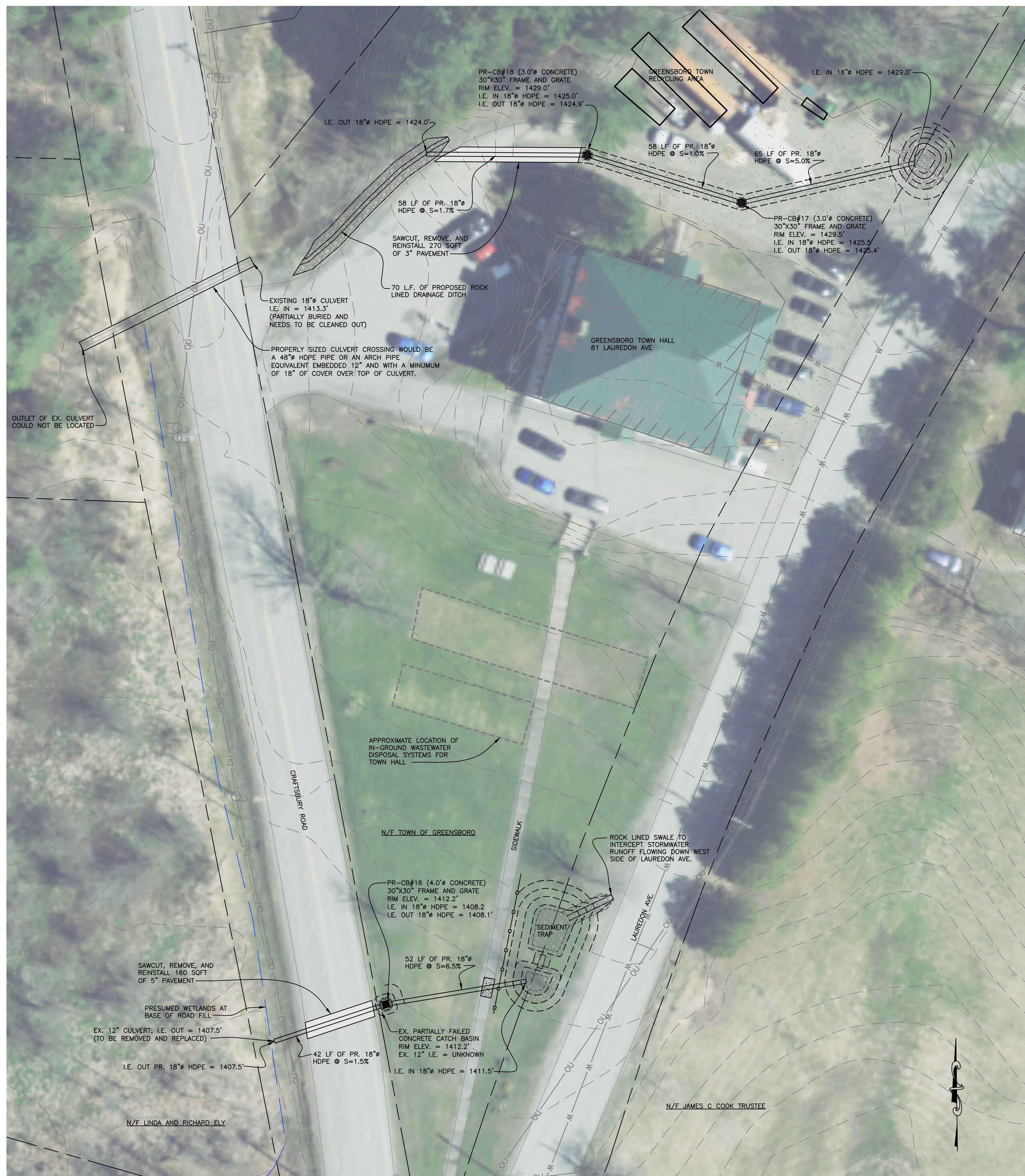
WILSON STREET STORMWATER PROPOSED UPSTREAM ALTERNATIVES 2, 3 AND 4