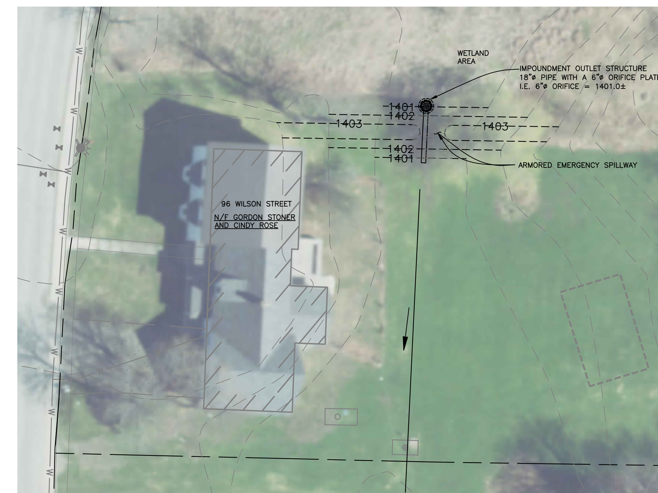
WILSON STREET STORMWATER PROPOSED ALTERNATIVE 5