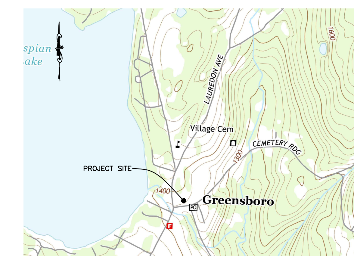
SITE LOCATION MAP NTS