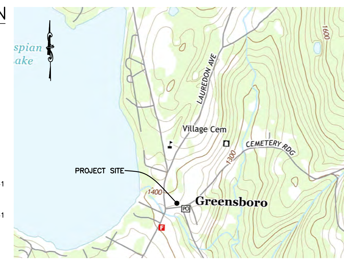
SITE LOCATION MAP NTS

IMPACTED SITE 1: LANDOWNER: CHAD SIMS & ELSA SCHULTZ 1608 CRAFTSBURY ROAD GREENSBORO, VT 05841 SITE: CHAD SIMS & ELSA SCHULTZ 1608 CRAFTSBURY ROAD GREENSBORO, VT 05841 SPAN #: 264-083-10938 TAX PARCEL ID#: 415-0032 TOTAL PARCEL AREA: 0.20 ACRES IMPACTED SITE 2: LANDOWNER: DEVIN BURGESS, JERILYN VIRDEN 42 WILSON STREET GREENSBORO, VT 05841 TOWN OF GREENSBORO SITE: DEVIN BURGESS, JERILYN VIRDEN 42 WILSON STREET GREENSBORO, VT 05841 TOWN OF GREENSBORO SPAN #: 264-083-10439 TAX PARCEL ID#: 404-0042 TOTAL PARCEL AREA: 0.36 ACRES