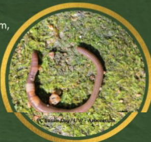
PC Brian Day/JW - Agbotarium