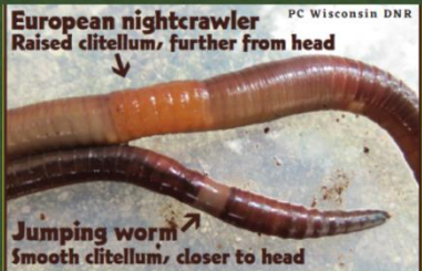
PC Wisconsin DNR European nightcrawler Raised clitellum, further from head Jumping worm Smooth clitellum, closer to head