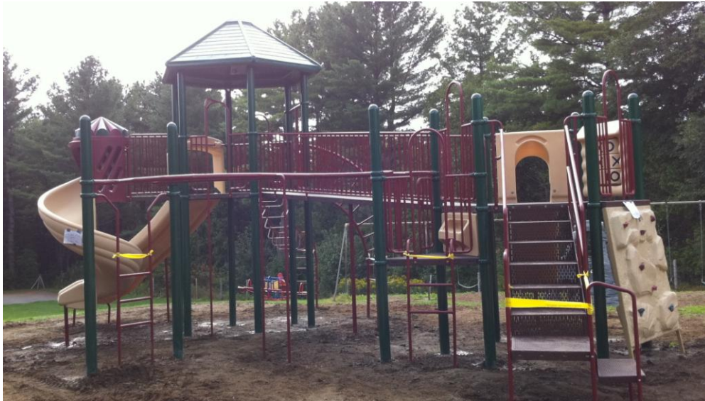
Lakeview Elementary School Playground