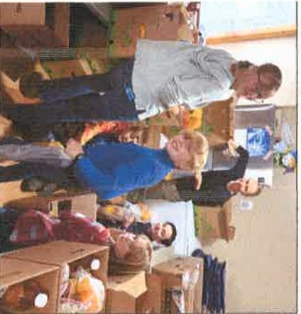
50+ Volunteers put in over 6,000 Volunteer Hours