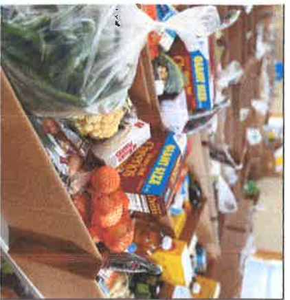
238,000 Pounds of Food were given out in 13,233 Boxes!