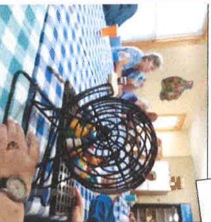
86 Community Gatherings plus 42 Community Meals