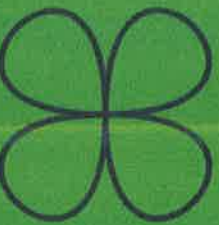
418 Families Served at our 2024 Toy & Warm Clothing Share